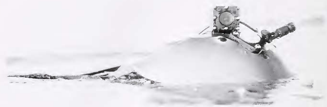
Figure 1. A horseshoe crab, Limulus polyphemus , mounted with a video camera, "CrabCam," for recording underwater movies and a microsuction electrode for recording responses from a single optic nerve fiber. A white Teflon cap (2.5 cm diameter) seals the recording chamber, which is attached to the carapace anterior to the right lateral eye. The barrel of the microsuction electrode protrudes from the recording chamber to the right. Tethers lead the video and optic nerve signals to recording electronics located on shore or in an overhead skiff as the animal moves about underwater at depths of 0.5 to 1 m. Experiments were carried out in an estuary near the Marine Biological Laboratory, Woods Hole, Massachusetts.

We have constructed a computational model of the lateral eye that predicts optic nerve responses with good accuracy (Passaglia et al. , 1998). In brief, the model treats the retina as an array of neurons that samples visual space as the compound eye does, incorporates the known excitatory and inhibitory integrative mechanisms of the retina, and adapts to changes in ambient illumination.